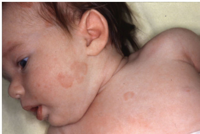
Figure 1. Characteristic annular erythematous lesions on the face of a child with cutaneous neonatal lupus.

suffice to correct heart failure and the outcome is often fatal. Most cases of significant cardiac muscle involvement are evident at birth or shortly thereafter, but cases of cardiomyopathy have developed a few months after birth, indicating the need for continued close monitoring of children who have cardiac NLE (Taylor-Albert et al , 1997).